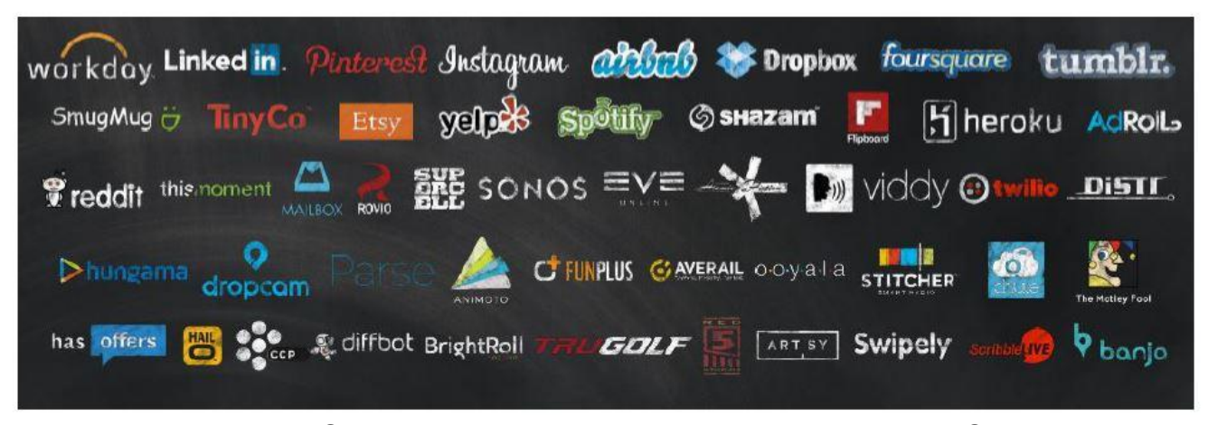
Figure: Startups as well as traditional applications use AWS